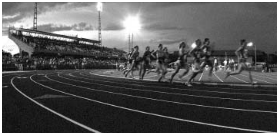
The Bernie Moore Track Stadium last played host to the NCAA Outdoor Track & Field Championships during the 2002 season.

The heart of any track and field program lies in its facility. LSU is fortunate enough to own one of the finest track facilities in America and the world in the Bernie Moore Track Stadium.