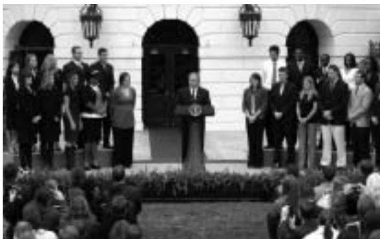
President Bush addressed 11 national championship teams on Champions Day at the White House on Nov. 12, 2008.

President George W. Bush welcomed the national champion LSU women's track and field team to the White House for Champions Day on Nov. 12, 2008, in honor of its victory at the 2008 NCAA Outdoor Track and Field Championships in Des Moines, Iowa.